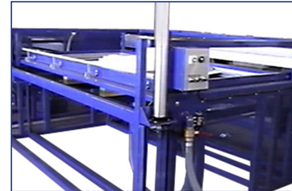
Option: Tooling Travel 32" Dual Cylinder Spur and Rack Guided