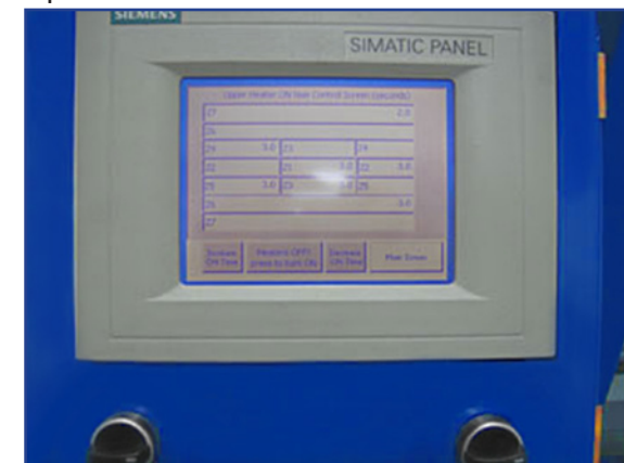
Option: PLC Heat Multi-zone Control