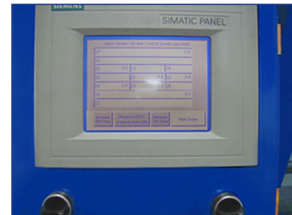
Option: PLC Heat Multi-zone Control