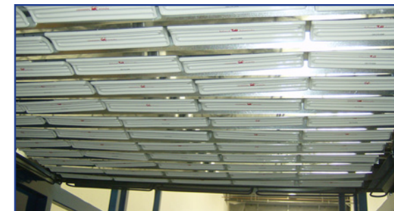
Option: Ceramic Radiant Heaters

For more information please contact your Belovac Representative at 951-741-4822 or at jb@belovac.com or visit www.belovac.com