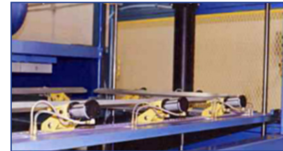
Option: Pneumatic Plastic Clamping System