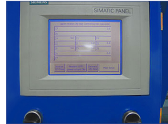
Option: PLC Heat Multi-zone Control